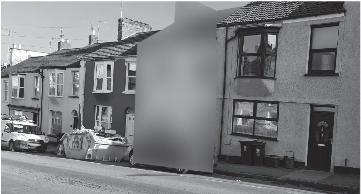
Figure 4: A blurred image

Some SVI applications allow owners to request that images of their homes be blurred (see Figure 4 ). They select the image and send a request via the website. However, this blurring can also attract the attention of criminals.