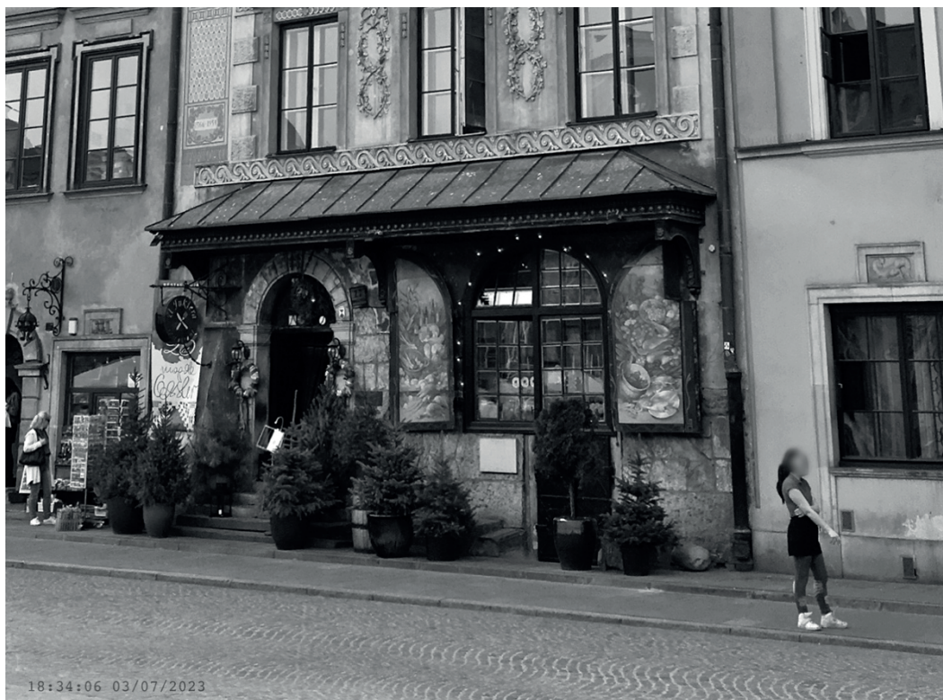
Figure 3: Criminal located using a street view image

The image was timestamped, revealing the date it was taken.